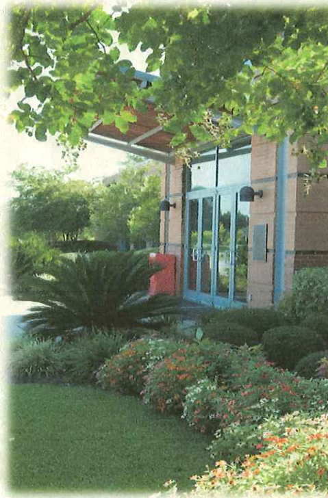
Valdosta Lowndes County Visitor Center