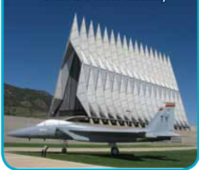
U.S. Air Force Academy

Centrally located in the U.S., Colorado Springs is easily reached from anywhere in the nation. Attendees traveling by car can follow Interstate 25 or US Highway 24 directly into the heart of Colorado Springs. Air travelers will appreciate the ease and convenience of the Colorado Springs Airport (COS), a modern facility located just 11 miles from downtown. Served by several major U.S. carriers, our airport provides frequent service via North America and major cities worldwide. FLYCOS.COM