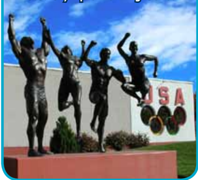
U.S. Olympic Training Center