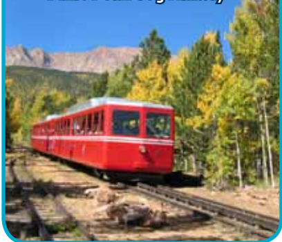
Pikes Peak Cog Railway